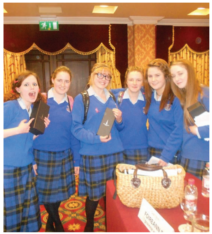
Debating team and supporters