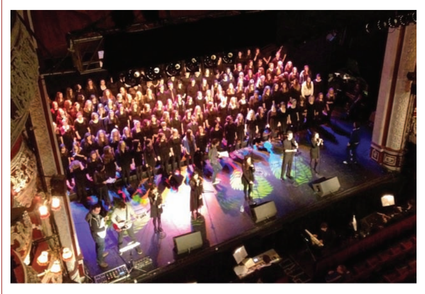
160 strong choir on stage in the Olympia