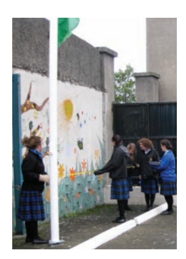
Sixth Years carrying out measurements

In the winter months, many sixth year students took to the grounds of St. Mary's to carry out fieldwork activities based on elements of 'Project Maths'. Students used clinometers to measure angles of elevation. Using trigonometric ratios (and remembering to add on their height to the calculated height of the building, as the students' reference point was their eye level above the ground!), students were able to calculate the height of the green flag pole and the height of the gym wall.