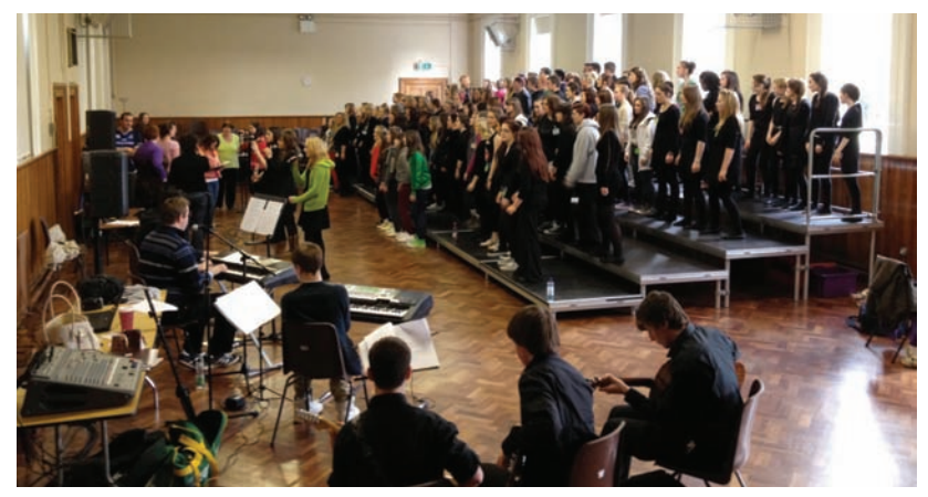
Rehearsal taking place in St. Mary's Choir Hall

Our students joined one hundred and forty students from different school choirs to make up the choir on stage that night. Overall it was a very uplifting and inspiring project and it certainly marked the beginning of a great project for young people to be involved in.