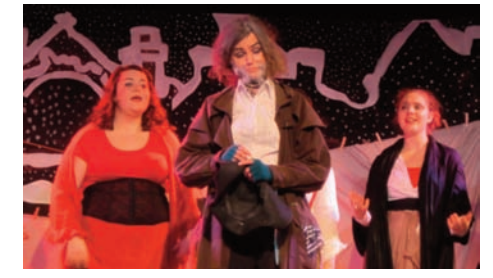
Fagin and Nancy