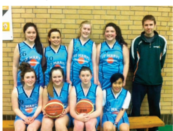
Senior Basketball Team

Our first year students also reached the guarter final of the division 1 league. They played against St Paul's. The match was a very close contest with