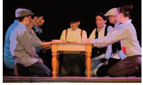
Oliver in the Orphanage