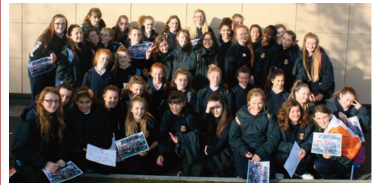
First and Second Year Teams - Trip to see the Ireland Women's Hockey Team