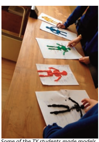
Some of the TY students made models of the human skeleton.