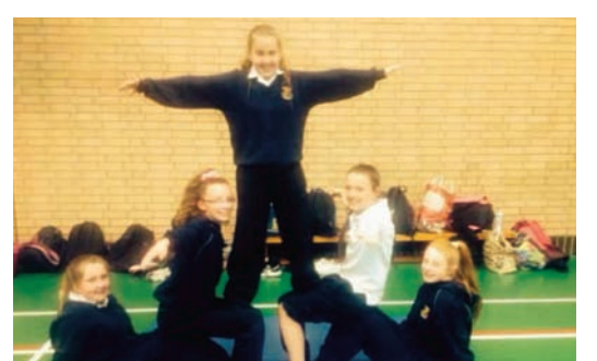
Gymnastics - P.E.