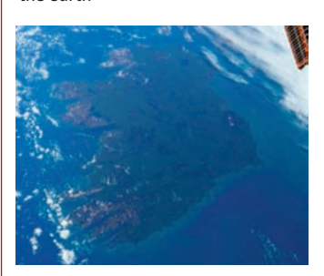
Ireland from Earth on a clear day without a solar eclipse. Can you see yourself?