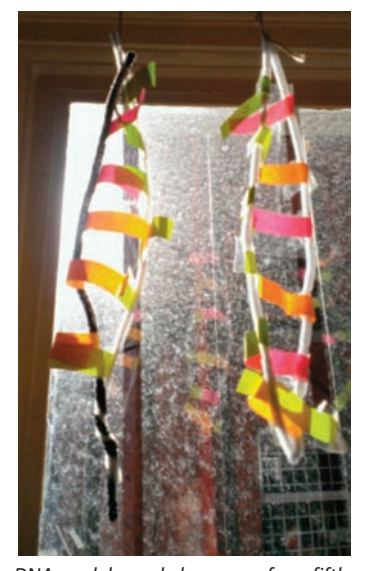
DNA models made by some of our fifth year Biology students.