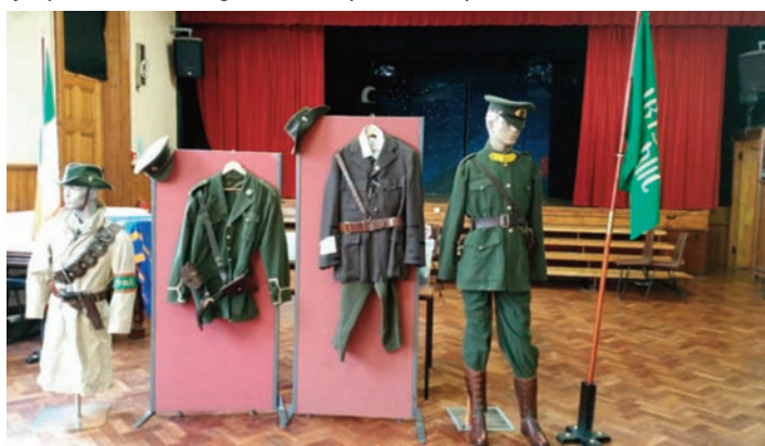
Replica flying column uniforms and uniform worn by Michael Collins