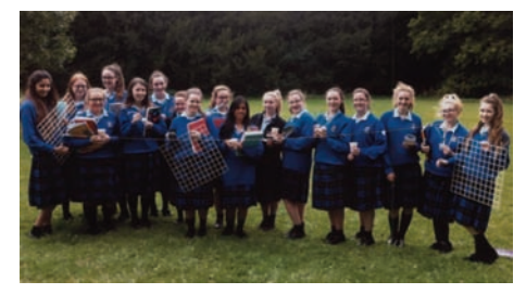
Sixth Year Ecology Fieldwork