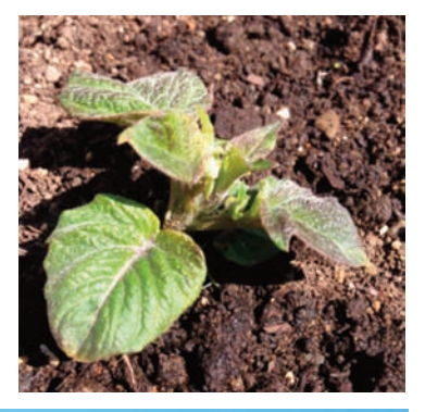
Transition Year Botanic Walk