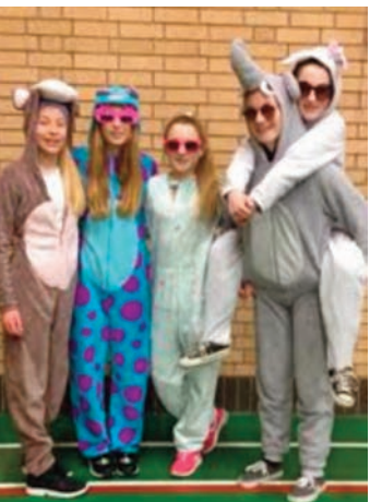
Dance - P.E.